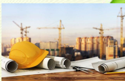
Project & Programme Management