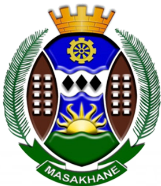
STEVE TSHWETE LOCAL MUNICIPALITY