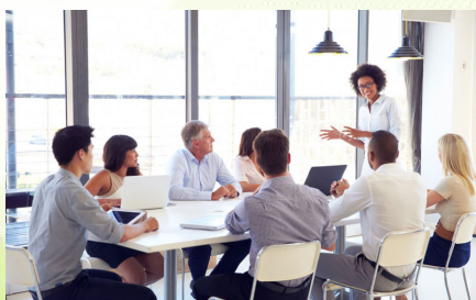
Training & Management Development